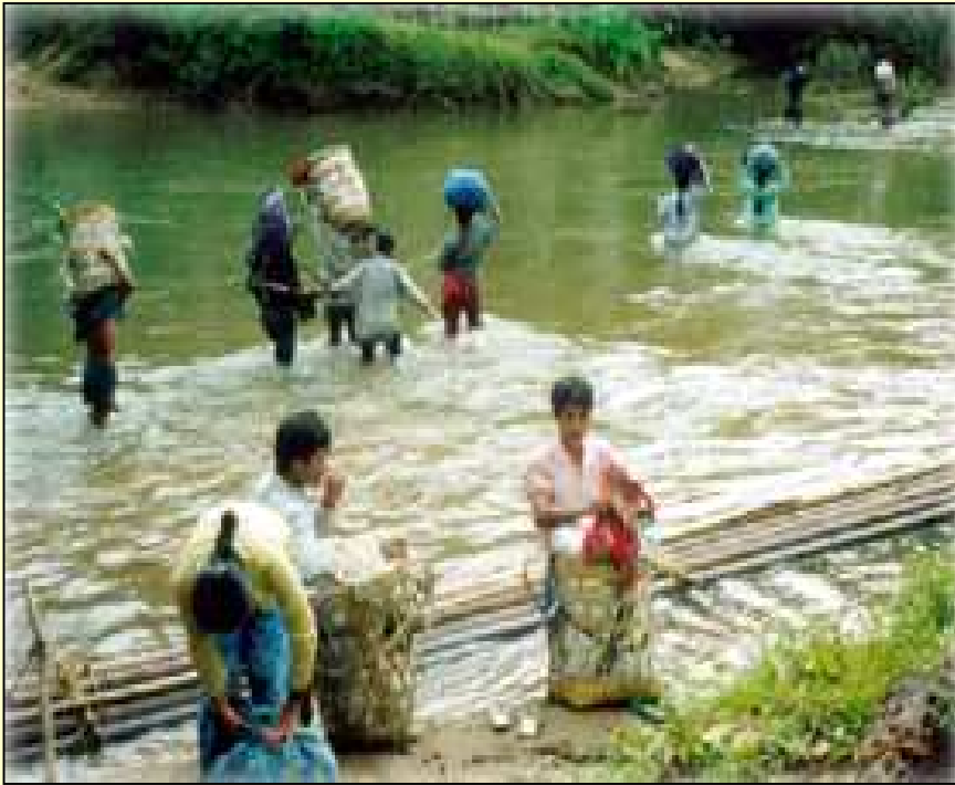
Backpack Health Workers travel to villages in Burma to see patients.